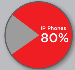
VoIP Network Energy Consumption

Did you know that IP phones are among the biggest energy users in an IP network, accounting for up to 80%